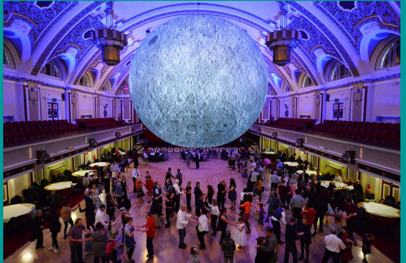
Tea dance at Museum of the Moon, Appetite, Stoke on Trent, part of the community-programmed Big Feast festival in 2018.

Funded by Arts Council England from 2012