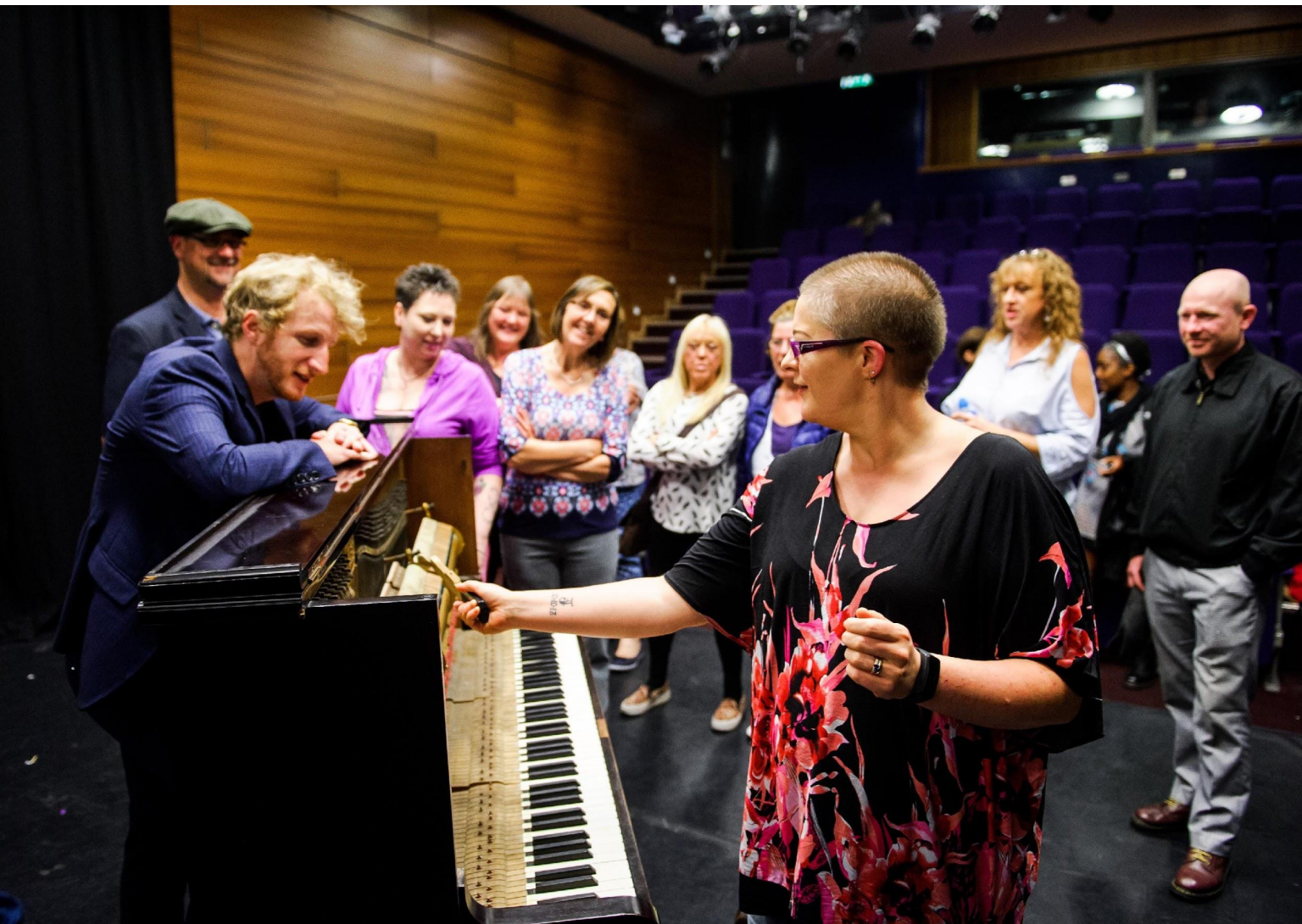
bait Go and See visit to Edinburgh Fringe with Escape Family Support group.